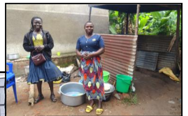
Above - the old kitchen